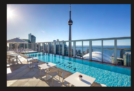
Rooftop Outdoor Pool