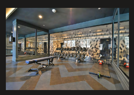
Gym & Fitness Area