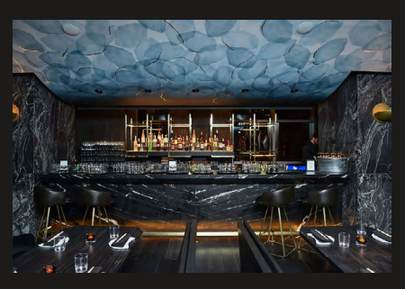
Bisha Hotel Lobby Bar