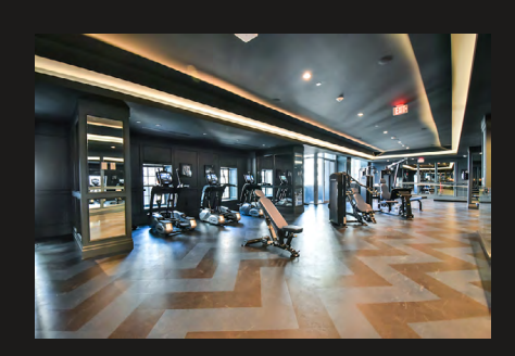
Gym & Fitness Area