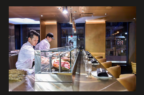
Akria Back Restaurant